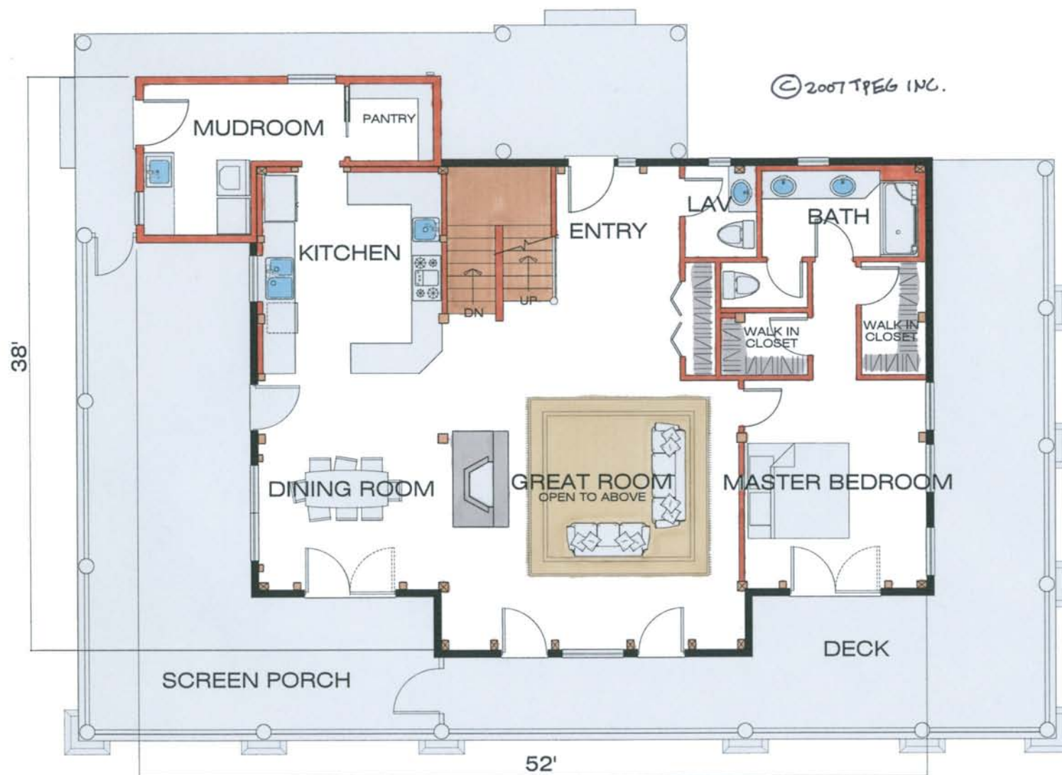
FIRST FLOOR PLAN 1453 SQ. FEET

To learn more about this plan, click here to contact us.