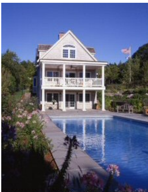
ABOVE: Poolside view of the guest house.

When it is time for the group to return for the day, the main house is poised to accommodate its share. In addition to the master bedroom, it has two spacious bedrooms on the second floor, each with its own bathroom. A large bunkroom over the garage is one of Mel's favorite features. Single beds covered with brightly colored quilts, child-sized furniture, and plenty of room