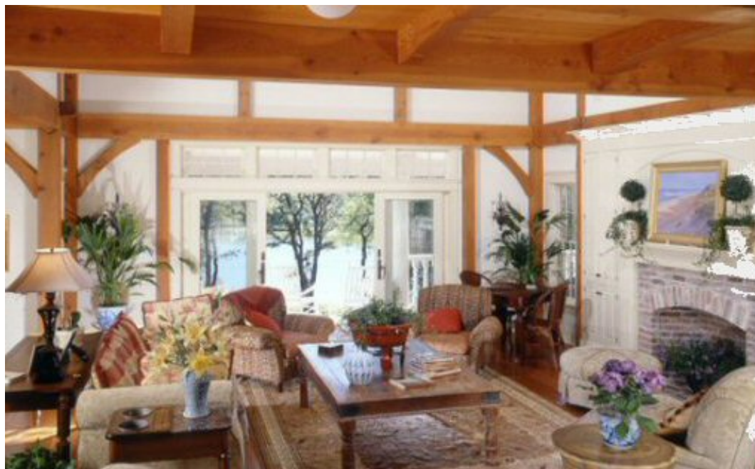
LEFT: Reds, oranges, and golds circulate warmth through the living areas. The H. Randle painting over the living room fireplace depicts Nauset Beach, where Ken proposed to Mel.

Before they could accommodate their growing family, however, they had to find the right lot in Orleans. The couple came close to buying a piece of land they had fallen in love with off Skaket Beach, located on the bay side. With vast exposed sand flats at low tide—a place where children might play in sun-warmed pools for hours—the property seemed perfect.