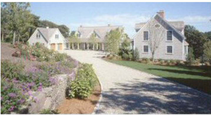
ABOVE: Crossroads created a landscape design that feels as though it has been in place for years, building a New England-style stone wall, incorporating existing and adding mature trees and shrubs, and grouping multiples of plants.