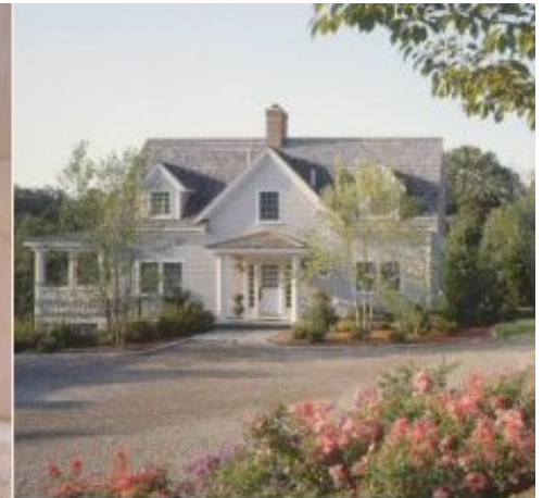
ABOVE: The guest house is oriented toward the pool and within waving distance of the main house. Ample porches encourage outdoor leisure.

of Timberpeg East, Inc. of Claremont, New Hampshire. "The Pilgrims brought this kind of construction with them from England. Plimoth Plantation was built this way. Any house more than 150 years old was built using post and beam construction."