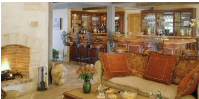
ABOVE: The lower level is designed for fun and entertainment. The media room, pool and ping pong tables are conveniently close to a full-sized bar. The brick floors, rough walls, and limestone-look fireplace conspire to give the area a feeling of age.

Cape Cod growth: scrubby pines, black and white oak, and locusts. The trees and native undergrowth provide a lush tangled backdrop to the newer landscaping, preserving a sense of established belonging. Landscaping, architecture, and interior decorations weave together to create a sense of permanence, which after all Mel points out, is what family's all about