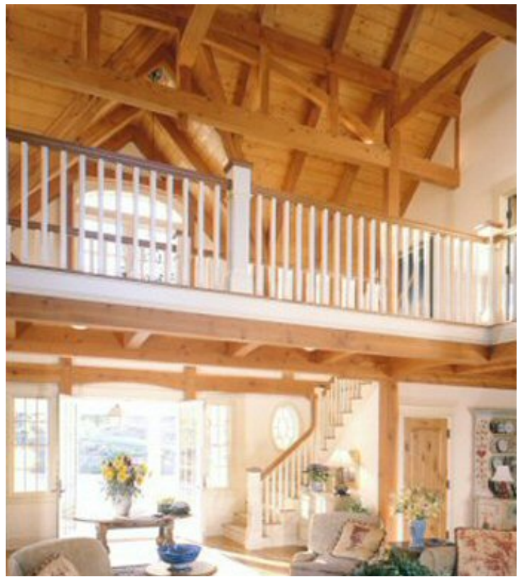
BELOW: A french wine tasting table is pressed into a welcoming role in the front foyer. The antique poster on the stairway wall is also French.