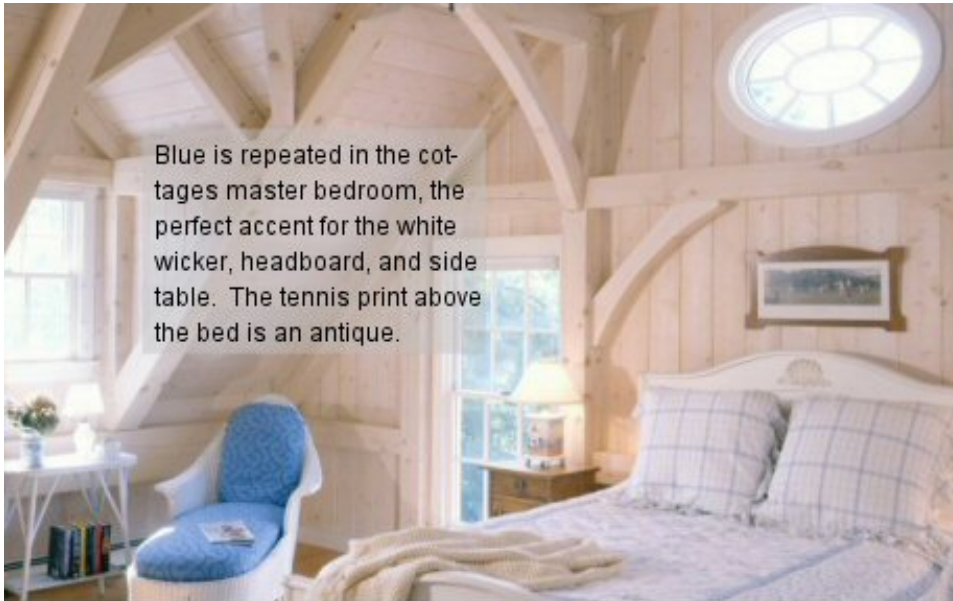
Blue is repeated in the cottages master bedroom, the perfect accent for the white wicker, headboard, and side table. The tennis print above the bed is an antique.