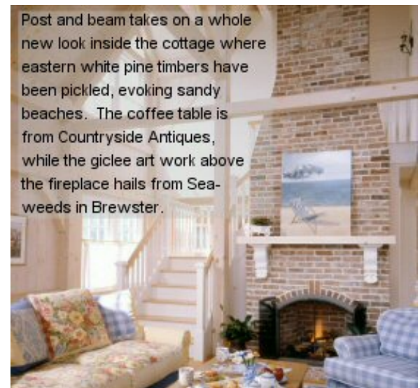
Post and beam takes on a whole new look inside the cottage where eastern white pine timbers have been pickled, evoking sandy beaches. The coffee table is from Countryside Antiques, while the giclee art work above the fireplace hails from Seaweeds in Brewster.

Historically, post and beam structures were built with timbers hand cut from trees and then squared with a hand ax. Completing a handcrafted house or barn was labor intensive. Raising the structures was often a community affair. The Industrial Revolution signaled the demise of post and beam built homes. As sawn lumber became readily available and easier to ship, "stick" construction became a less expensive, faster method. "Timber framing was almost completely forgotten for a century," Britton remarks. "Even in Vermont and New Hampshire, when you look at barns built after 1900, almost none are timber frame."