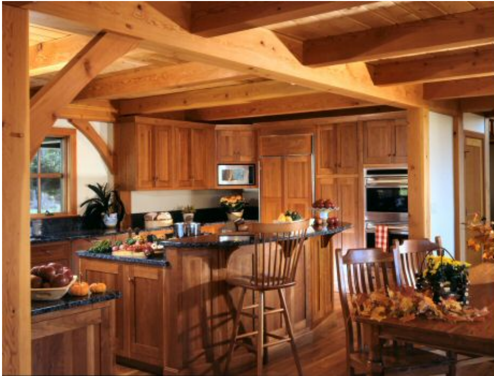
Left: Tucked under lowered ceilings, the Jacksons' cozy kitchen is outfitted with wood cabinetry topped with granite.