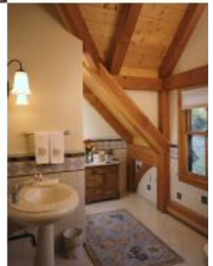
Right: Guests feel transported to the shore in this bathroom, accented with diamond-patterned blue and white tiles.