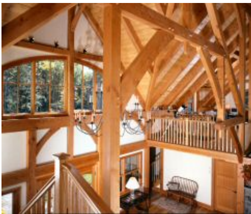
Left: "You walk into the front door and see both the magnitude of the great room and the vista out that glass wall," Don says. "Everybody that walks in... you can almost hear their jaw hit the floor."

The couple bought a gazebo and placed it on the ledge, then spent many sunsets there, contemplating the home they would build. The house, completed in 2003, includes a sunroom that sits just 18 feet from the gazebo.