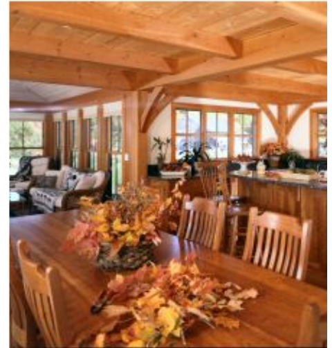
Above: Windows wrap around the kitchen and sunroom offering the Jacksons a panoramic view of their lot.