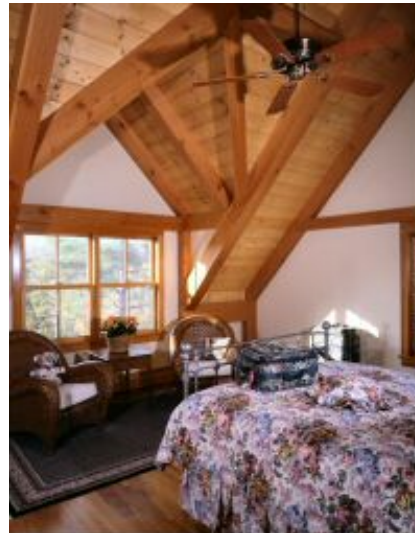
Left: Under the rafters to one side of the great room, a guest bedroom is highlighted by a beautifully framed dormer window. Hard-wood floors gleam underfoot.