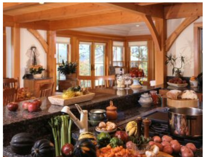
Below: With its prep sink and cook top, the island offers the chef a workspace that's connected to the action in the great room.

Don admires the great room's timbers: "When I look up at the structure...at the joinery at the top, I just marvel at that."