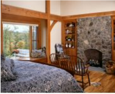
Above and right: High ceilings in the master bedroom add drama a window seat looks out over the home's wooded views.