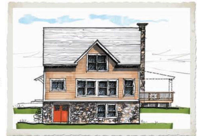
Dining Room Side